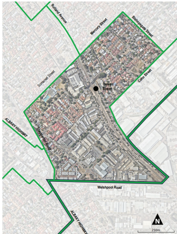
Figure 1. Local Planning Strategy – Oats Street Neighbourhood 10 boundary